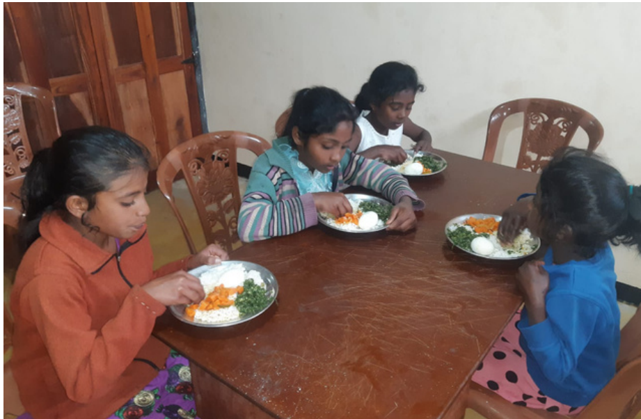
Children come to church for a daily meal